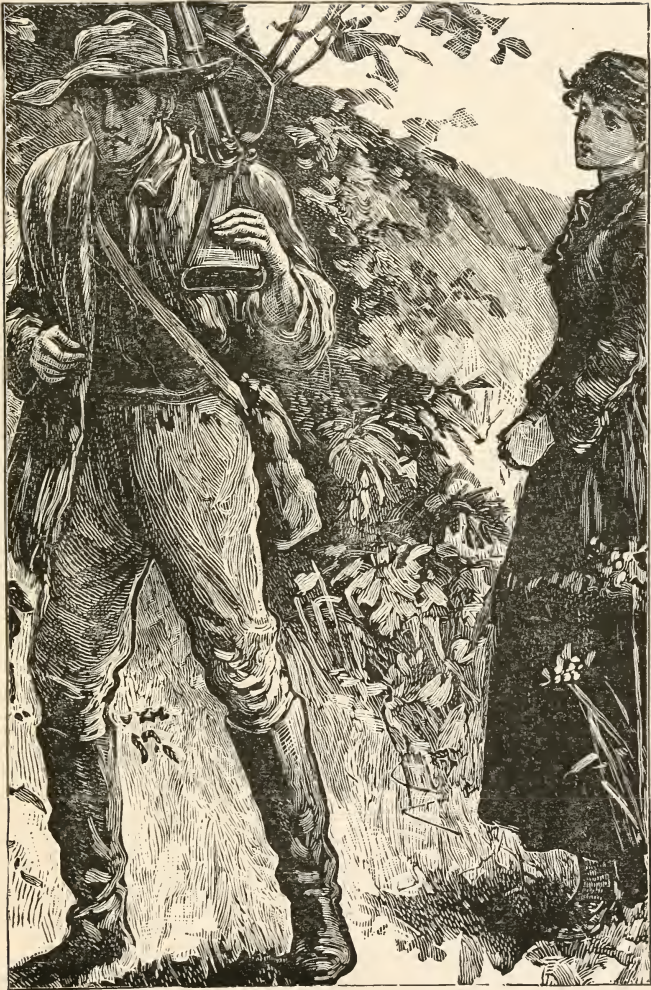
HE WALKED SWIFTLY AWAY.—PAGE 918